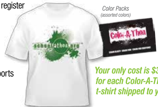
Color Packs (assorted colors)

Your only cost is $3.00 for each Color-A-Thon t-shirt shipped to you.