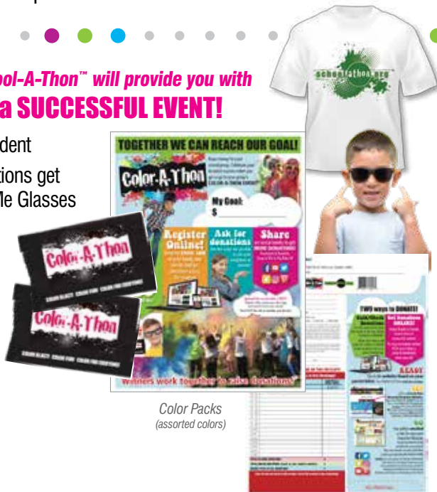
Color Packs (assorted colors)